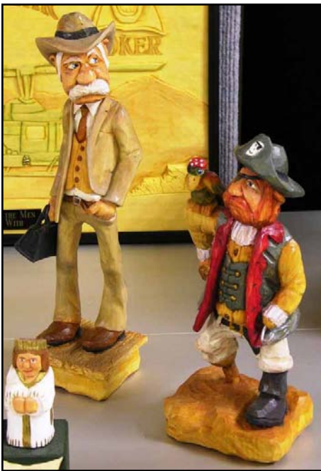
Tom Miessler carved two Gerald Sears roughouts: Pistol Pete (pirate) & Country Doctor. The old man with bird and basket of seed started with a block of wood.