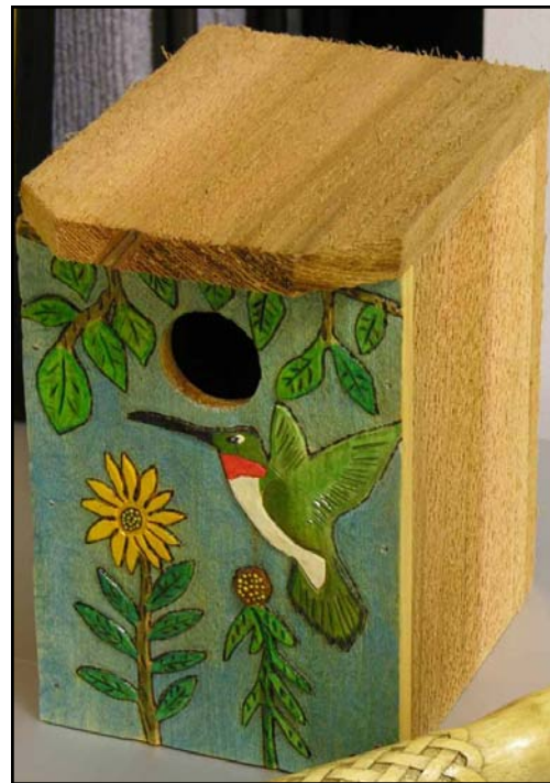
Shelley Key made this bird house from cedar with a basswood face that she relief carved. She put on 3 coats of spar so it can be used outside.