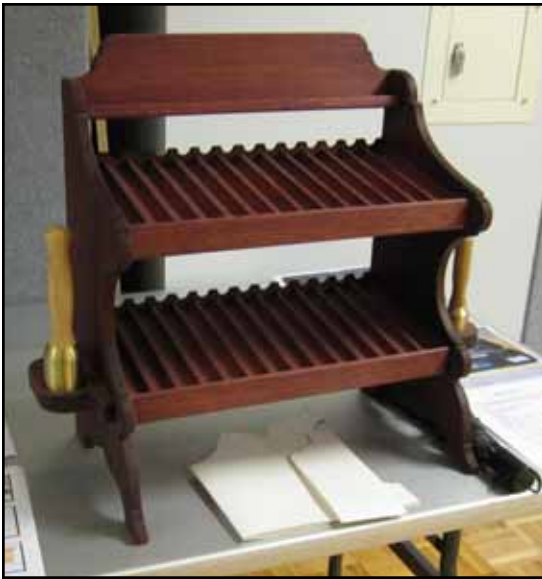
Norman Landry brought a rack and instructions, for holding Swiss-made tools.