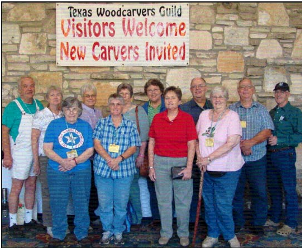
HAWC Group Picture