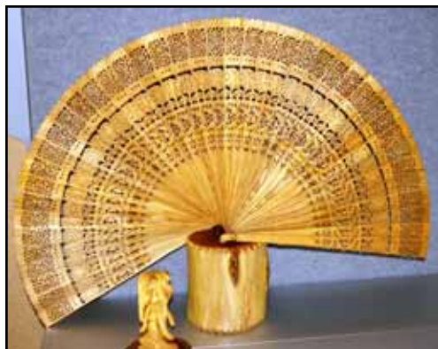
Berny made a large lacey fan with cigar box sample wood