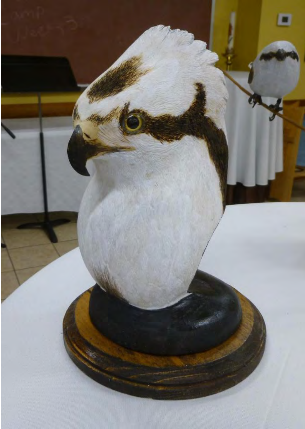
Lance Rath: Osprey bust