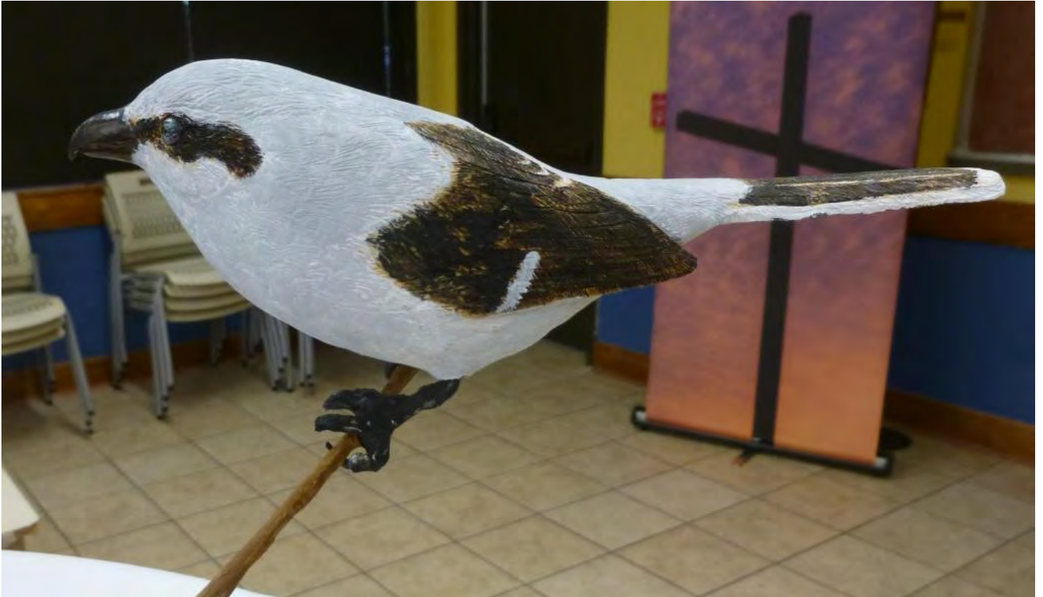
Lance Rath: Loggerhead Shrike or "butcher bird."