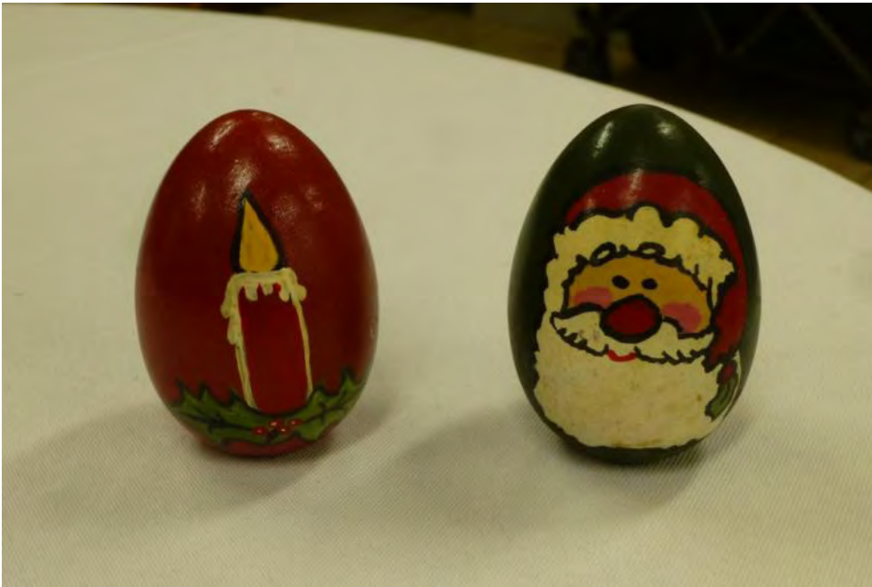
Ronnie Boston: eggs he bought at garage sale for $1.00