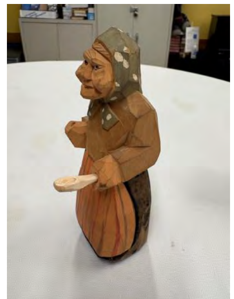
Ronnie Boston bought this flat plane carving from a garage sale for $3.00