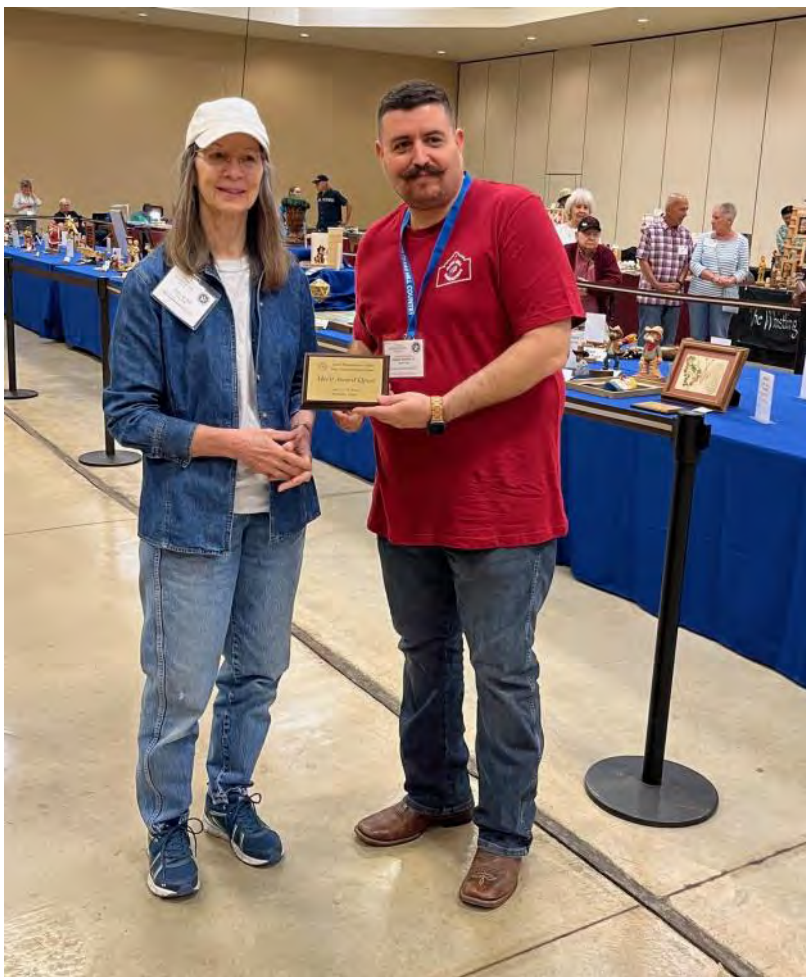
Award at TWG Show for this Chip Carving