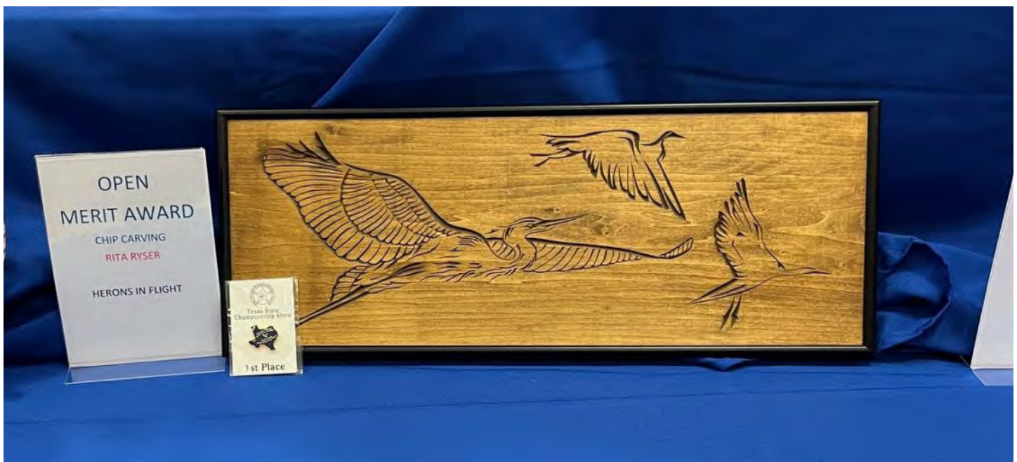
Rita Ryser: Open Merit Award Chip Carving