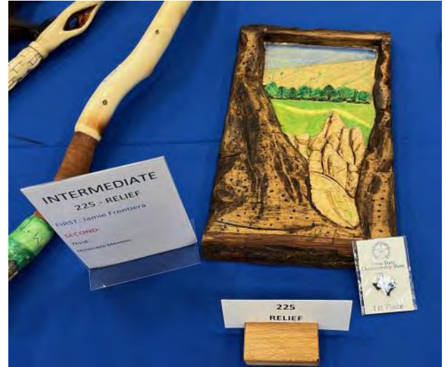
Jamie Frontiera: Intermediate Chip Carving 1st, & Intermediate Relief Carving 1st