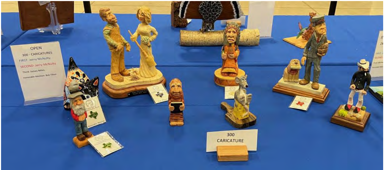
Jerry McNulty, Top photo: Open Caricatures 1st & 2nd; Bottom photo: Open Mythical 1st