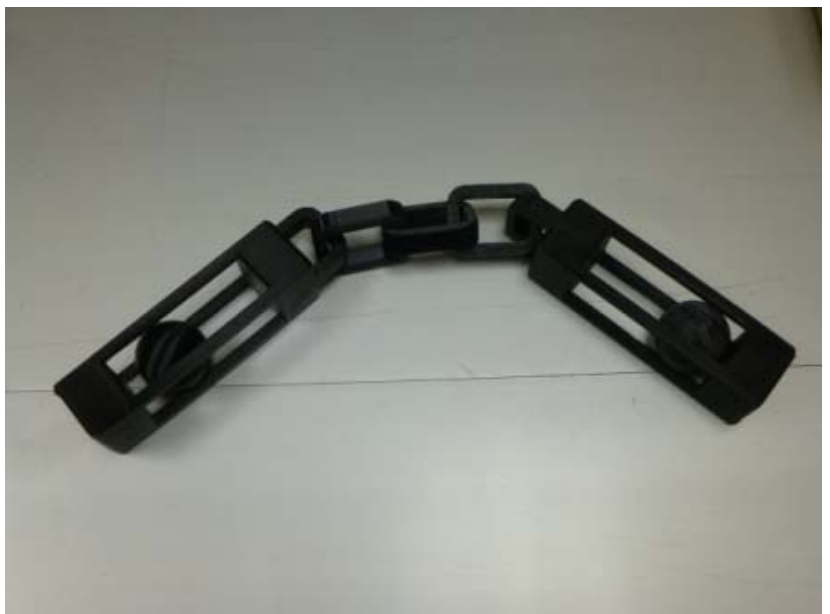
Randall Clements showed us a unique ball and chain that was not carved. It was printed with a