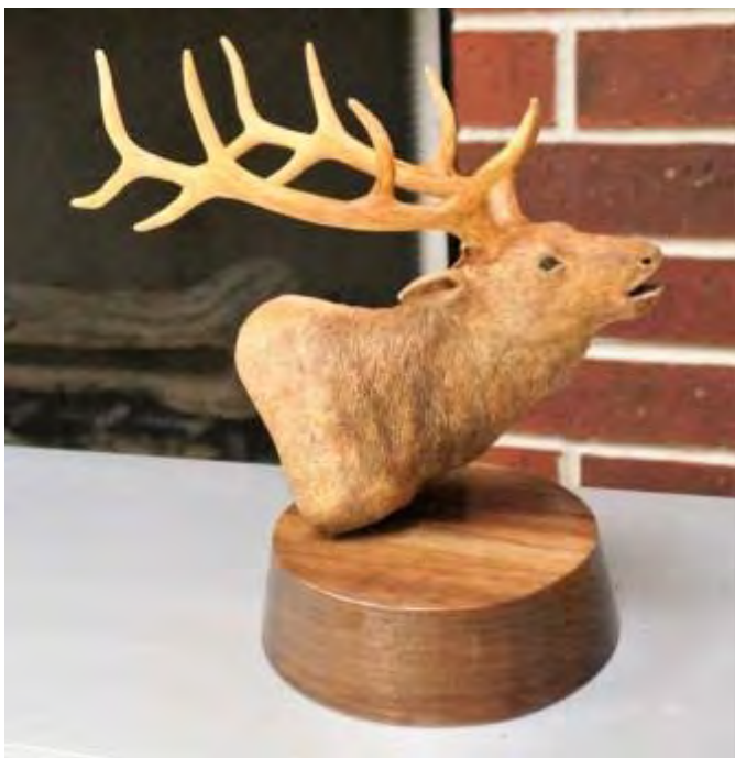
Lance Rath: Elk bust