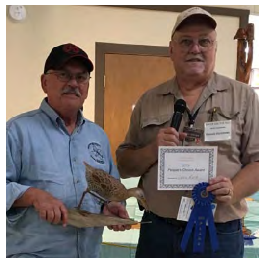
2019 RGV People's Choice Award