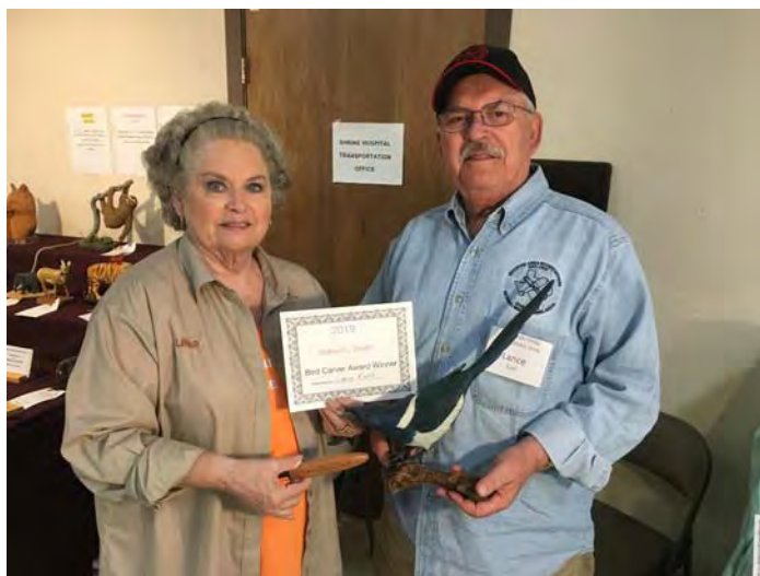
2019 RGV Milton E Smith Bird Carver Award

We will be heading home on Thursday the 17 th , after teaching three days of classes. See you on Saturday the 26 th .