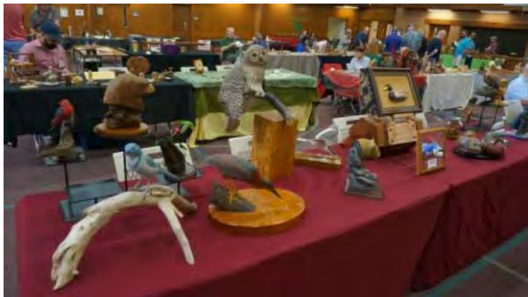
Best Table, Lance Rath