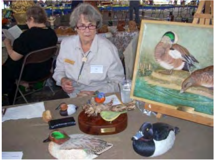
These two pages are in memory of Ann Wallace