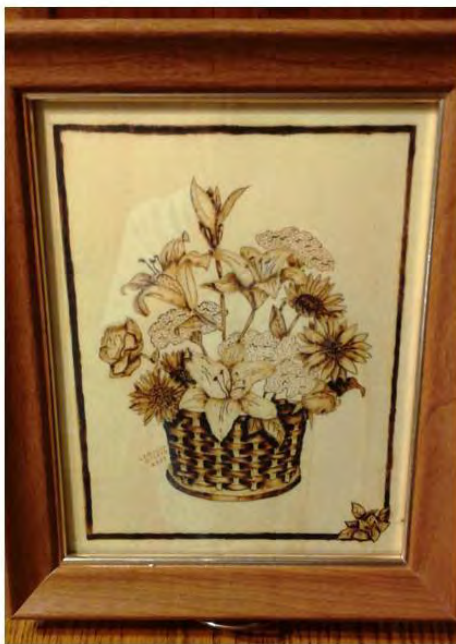
Soft Shading Technique