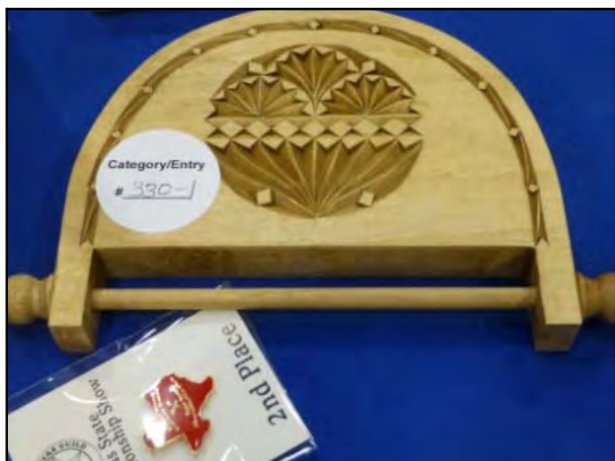
Carolyn Halbrook, 2nd, Open Chip Carving