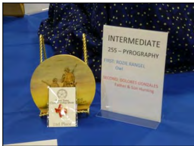
Dolores Gonzalez, 2nd, Int. Pyrography