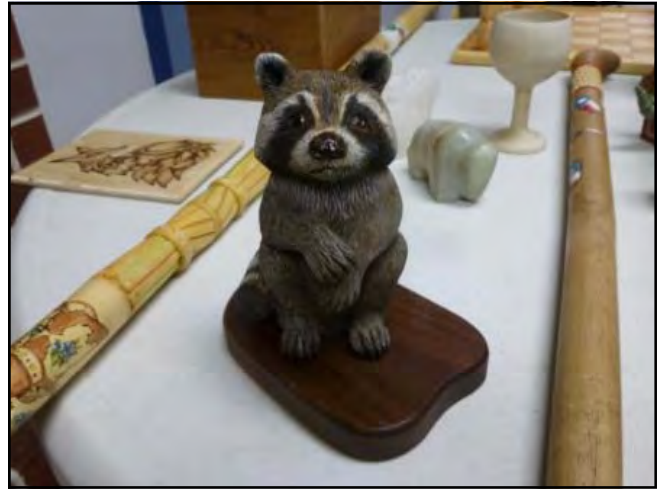
Butch Wilken's raccoon