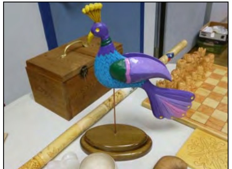
Unknown: Peacock, Teddy Bear