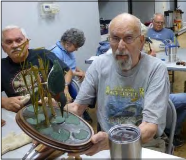
green heron