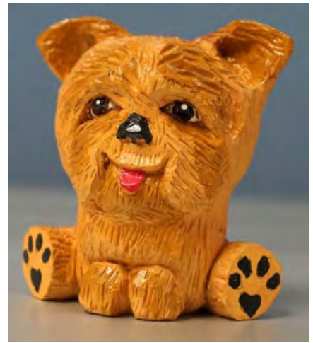
Bob Zellers: birds, rabbit, dog