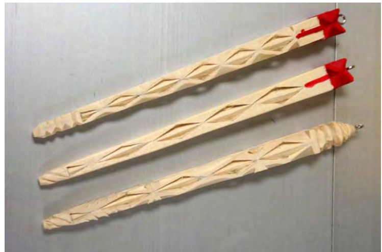
Fred Childers: Icicles