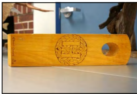
Randall Clements, Chip Carved Wine Holder