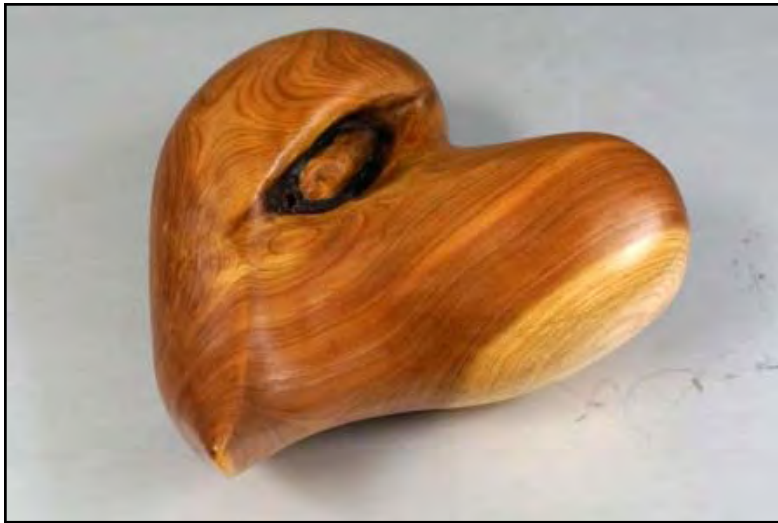
Butch Wilken, Stylized Heart