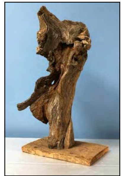
Charles Glass, Found Wood