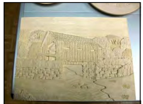
Zane Bumgardner, Relief