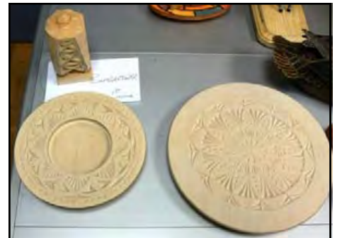
Zane Bumgardner, Chip Carved Plates, Carving Con- test TWG - 1st Place Novice