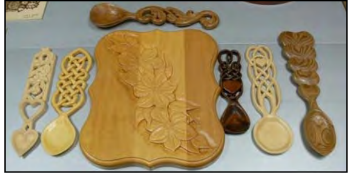
Randall Clements, Shallow Relief and various spoons