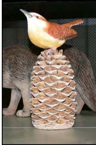
Butch Wilkin, Wren on pinecone