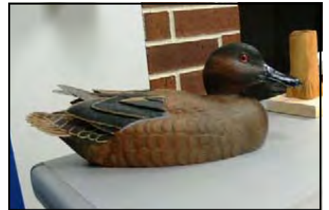
Northern Cinnamon Teal