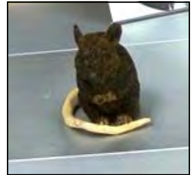
Terry Kirschke, Sitting Mouse