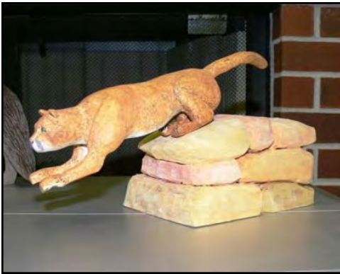
Shelley Key, Cougar