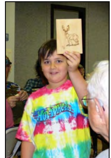
Raiden's Wood-burned Deer