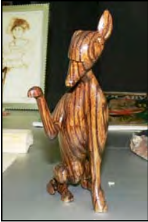
Hy Applebaum, Dog