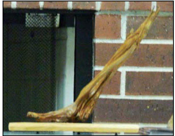
Charles Glass carved this found wood. Some kids told him it looks like a stick; he says it's art.